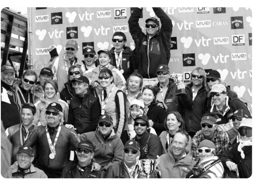
A group of very happy American Masters celebrate winning the Nations Cup at Valle Nevado, Chile, this summer. Victory is sweetest when accomplished with friends.

Hopefully, Northern can have even a bigger contingent of racers this year, with Nationals being at Park City, UT and Western Regionals being at Big Sky, MT. Major