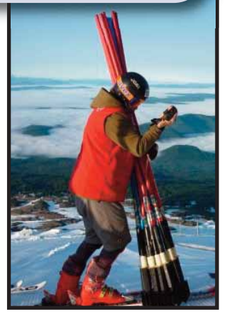
Course setting at o'dark thirty am.

www.skiracereg.com. We welcome all levels of racers—take the challenge in the gates with new friends!